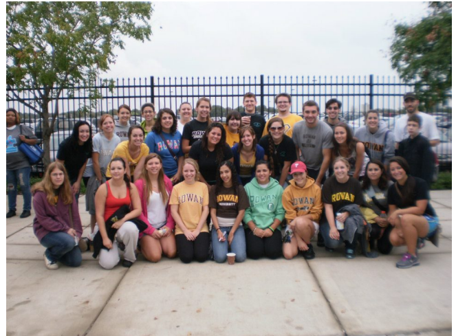
ABA Club represented Rowan University at the Walk Now for Autism Speaks- Philadelphia on September 24 at Citizen's Bank Park.

In general, ABA Club is becoming a larger presence in the Psychology Department with both professors and students. For up to the minute information on the club, please visit our Facebook page at http://www.facebook.com/groups/RowanABA